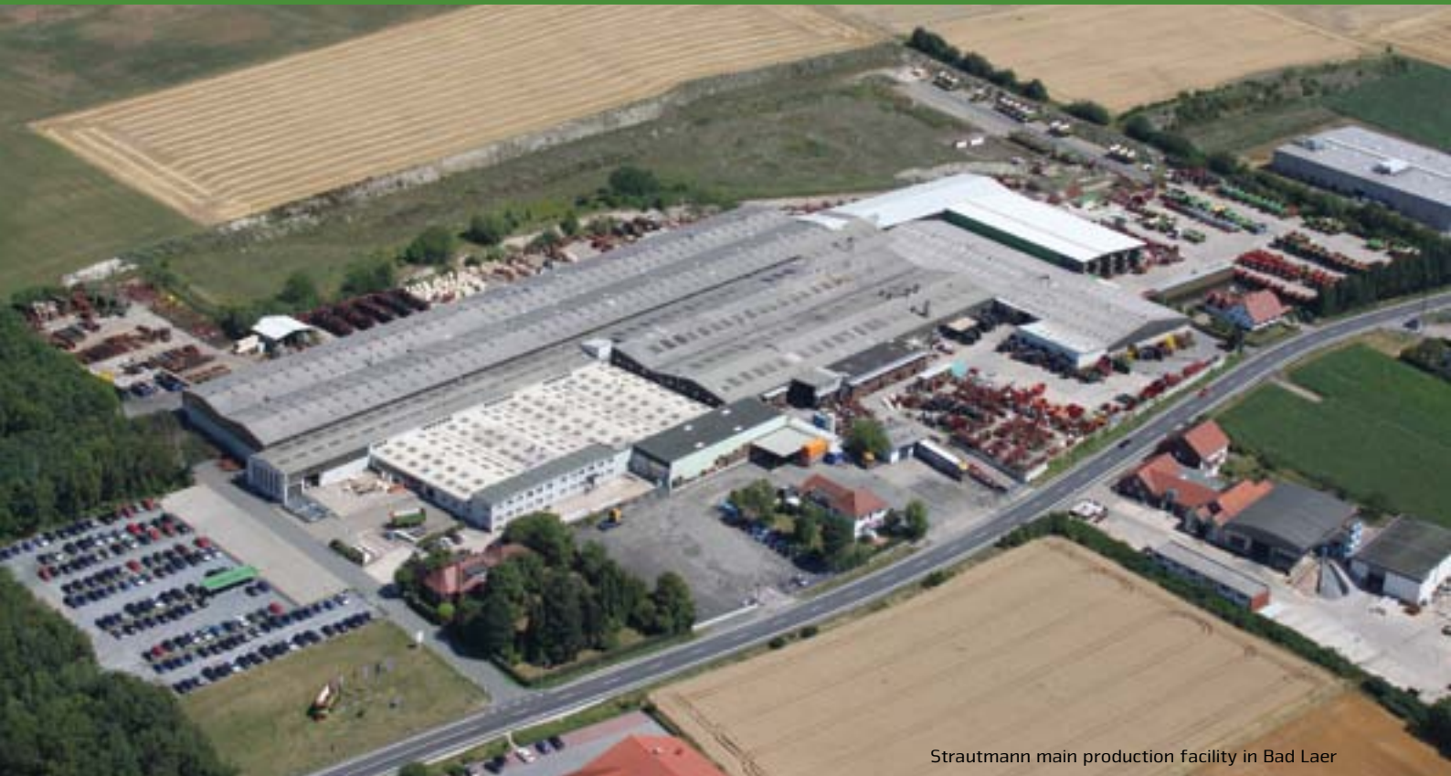
Strautmann main production facility in Bad Laer