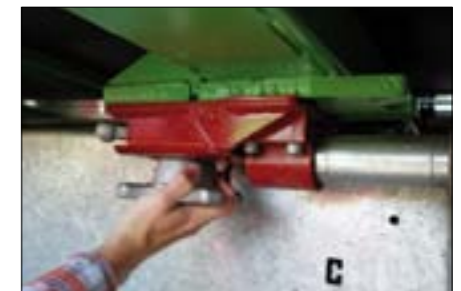
Time-saving Twist lock fasteners having proved their worth many times over