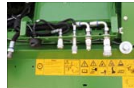
Without use of tools Quick couplings of hydraulic connectors

The overlapping period between spreader and forage transport wagon use is rather short. Therefore, the chassis can be used with a Strautmann 3401 spreader or forage transport wagon body Giga Trailer 5401. At the change of season, you simply exchange the body and save real money!