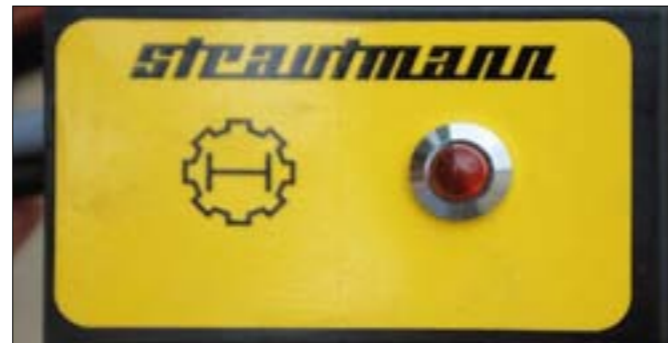
Anzeige bei Direktanschluss