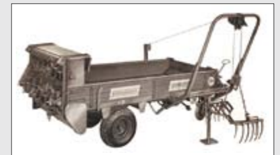
Streublitz with side loader from 1957

Strautmann is setting standards in terms of stability, long service life and flexibility. A high degree of stability under load and a long service life are the most important features that characterise a good spreader.