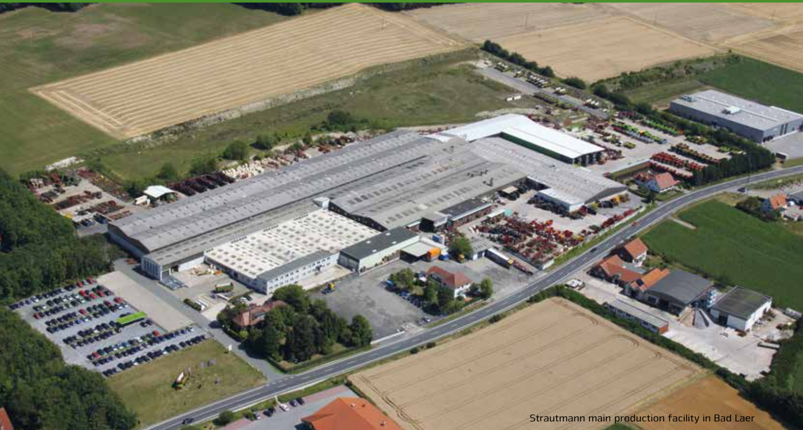
Strautmann main production facility in Bad Laer

B. Strautmann & Söhne GmbH u. Co. KG is a medium-sized family-owned company located in the administrative district of Osnabrück having already celebrated its 80th anniversary of existence and now being managed by the third generation. In a modern plant at the second production site in Lwówek (Poland), Strautmann manufactures individual machine components and, apart from that, also parts