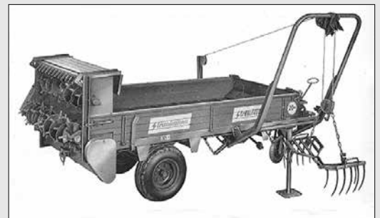
Streublitz with side loader from 1957

Be among those who benefit therefrom! Strautmann is setting standards in terms of stability, long service life and flexibility. A high degree of stability under load and a long service life are the most important features that characterise a spreader.